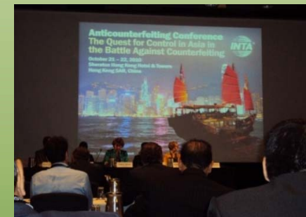
INTA Meeting on AntiCounterfeiting Hong Kong 2010