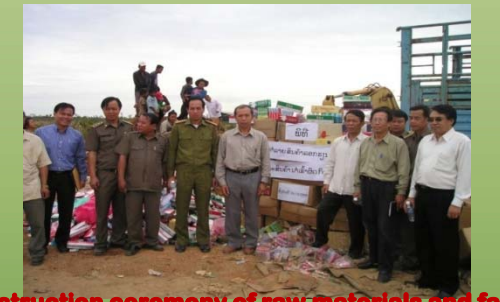
estruction ceremony of raw materials and fake products