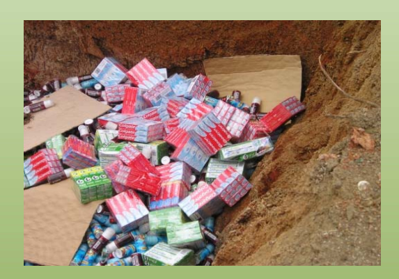
Seized Fake product destruction at solid waste disposal site