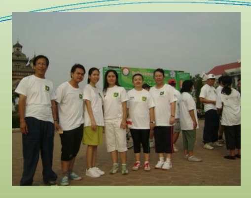
Health Walking World IP day