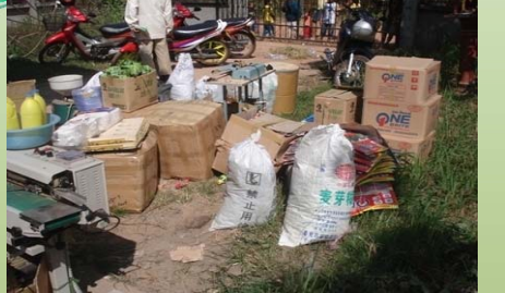
Part of the seized goods and machinery