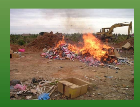
Fake products destruction by burning