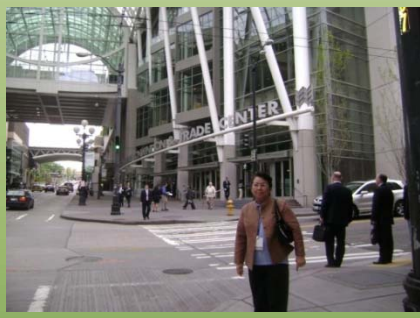
2009 INTA Annual Meeting, Seattle USA