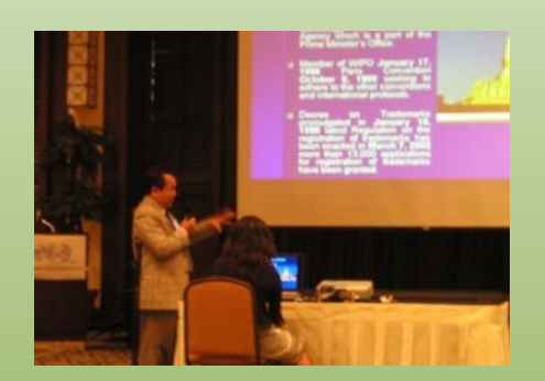
Annual Meeting APAA - 2003 in Kota Kinabalu - Malaysia